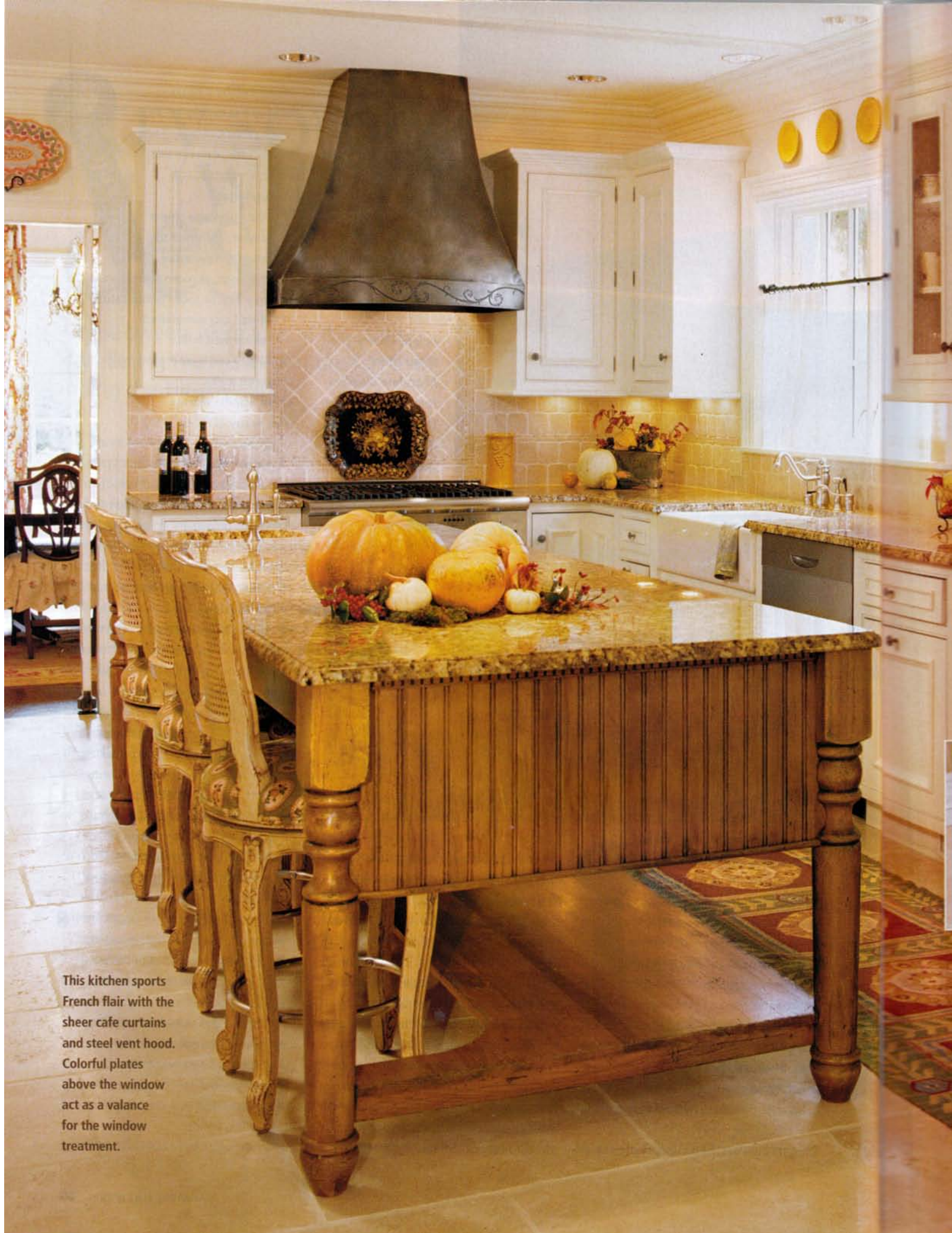
This kitchen sports French flair with the sheer cafe curtains and steel vent hood. Colorful plates above the window act as a valance for the window treatment.